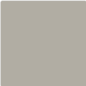
Aluminium Window and Door Frame Colour Wideline - Colorbond Dune - Matt