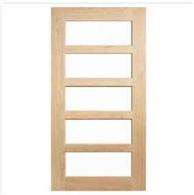
Front Door Profile Corinthian Doors - Blonde Oak - AWOWS 5G - Translucent Glass Entry