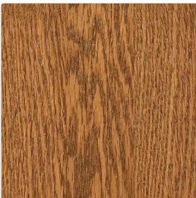
Front Door Colour Johnstone's - Clarendon Dark Stain NH 135 Entry