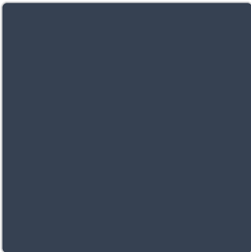
Colorbond Roof Selection Colorbond - Custom Orb - Deep Ocean