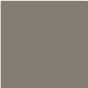
PVC Downpipes Taubmans - Colorbond Gully CB 70