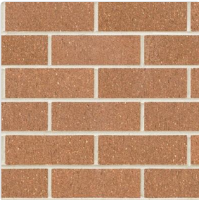
Brick Austral Bricks - Everyday Life - Unwind